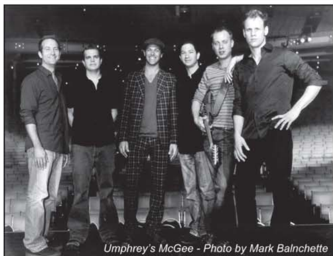
Umphrey's McGee