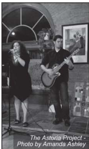
The Astoria Project