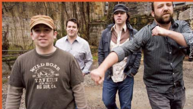
ASSEMBLY OF DUST AT LIVE FREE FESTIVAL

upstatelive .com Radio News Online Issues Visit our NEW website!