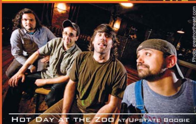
HOT DAY AT THE ZOO AT UPSTATE BOOGIE