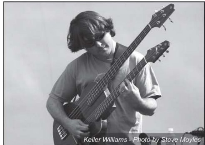
Keller Williams