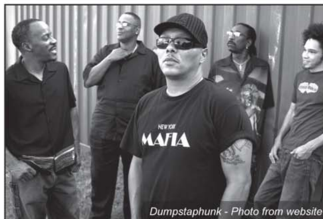
Dumpstaphunk